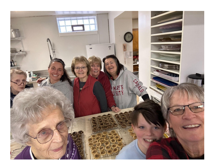
A Fun day baking together!!

Our annual Christmas Cookie and Baked Potato Sale was another success. Thanks to everyone for their contributions of cookie baking, donations and help.